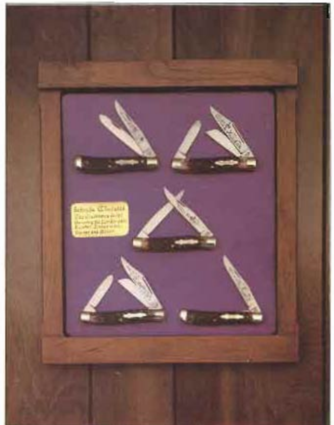
Shown above is the knives and display as you may show them in your home.

Each Schrade Cutlery Classic knife will be subjected to a number of rigorous inspections to insure that only flawless specimens are issued.