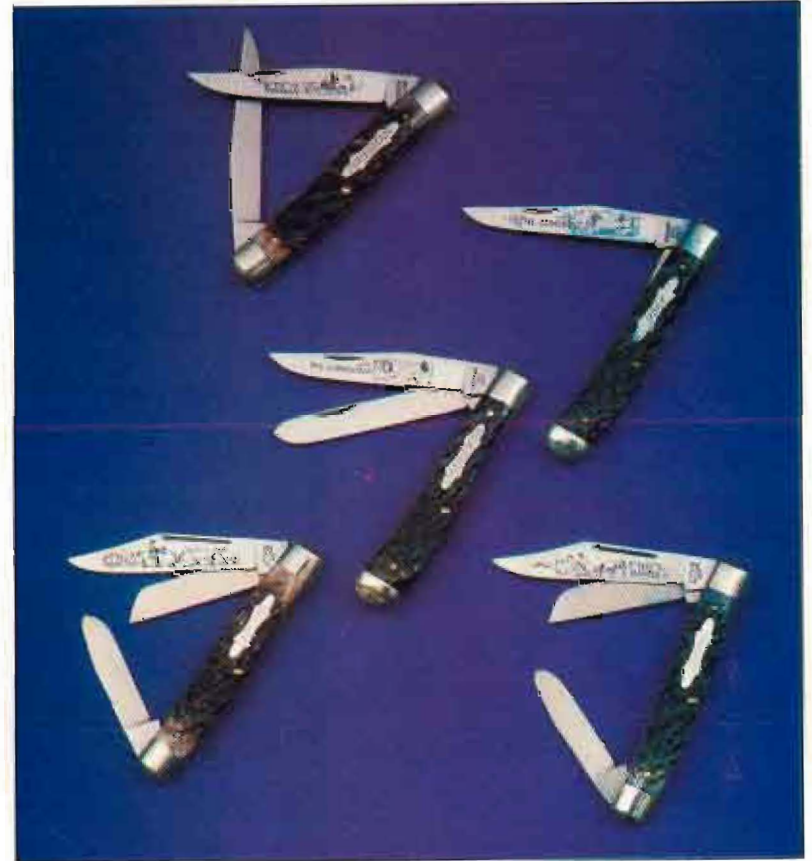
Knives shown smaller than actual size.