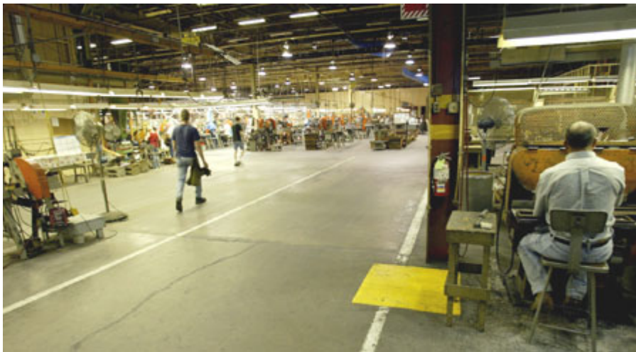
One of the main floor assembly areas for Imperial Schrade Corp, maker of a wide assortment of knives.