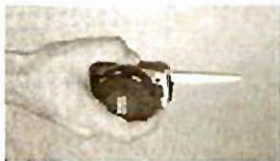
1. Locked Position

Improper use can cause serious injury. Schrade Cutlery cannot accept liability for injuries caused by improper use or care.