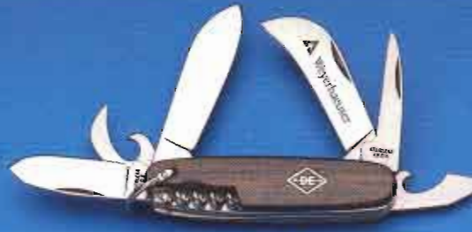
DE557AL 7-bl. Outdoorsman 3 3/4" closed.