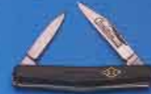
DE552AL Penknife 2 1/4" closed.