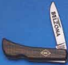
DE553AL 3" Lockback

with woodgrain acrylic handles, high-carbon stainless blades. Master blades are saber-ground and double-honed for lasting, friction-free cutting. Crafted in Ireland. Gift boxed.