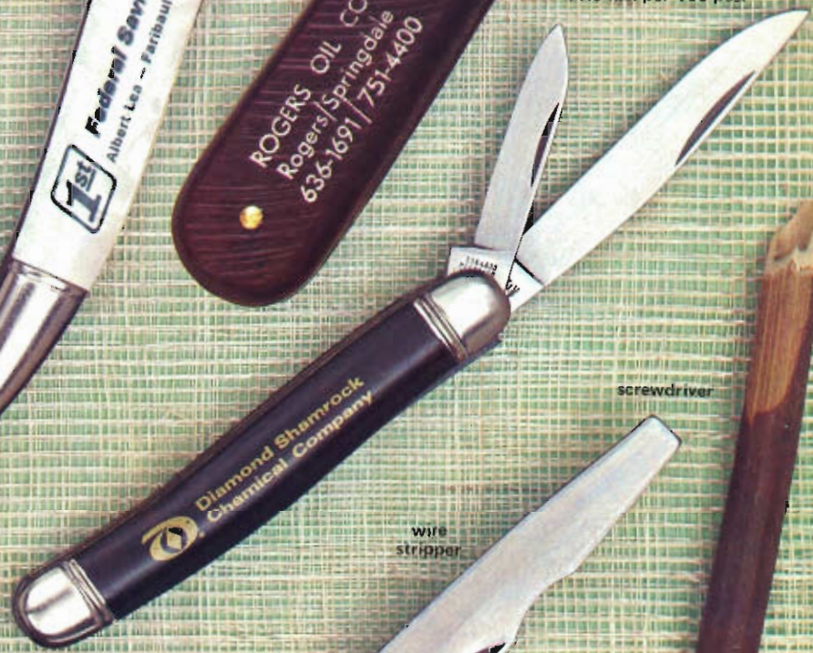
AL-72 BLACK BEAUTY 11.0 lbs. per 100 pcs.