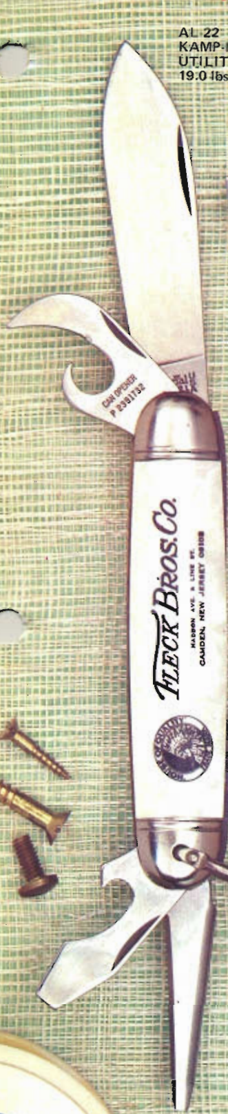
AL-22 KAMP-KING™ UTILITY KNIFE 19.0 lbs. per 100 pcs.