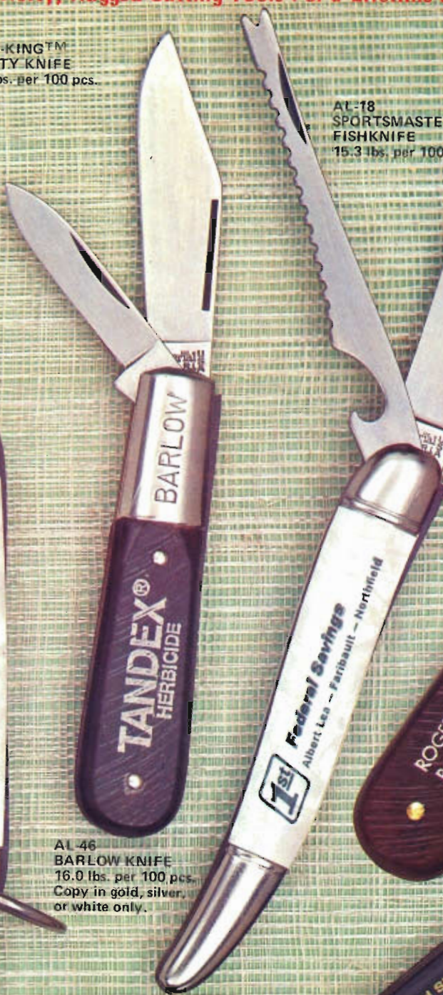
AL-18 SPORTSMASTER™ FISHKNIFE 15.3 lbs. per 100 pcs.