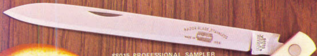
SS015 PROFESSIONAL SAMPLER Unbreakable Ivoroid Delrin handle. Brass linings and nickel silver bolsters. 5-15/16" closed. 12.5 lbs. per 100 pieces. Maximum 33 letters per line, 2 lines per side.