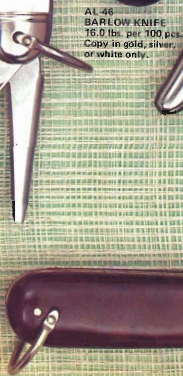
AL-46 BARLOW KNIFE 16.0 lbs. per 100 pcs. Copy in gold, silver, or white only.