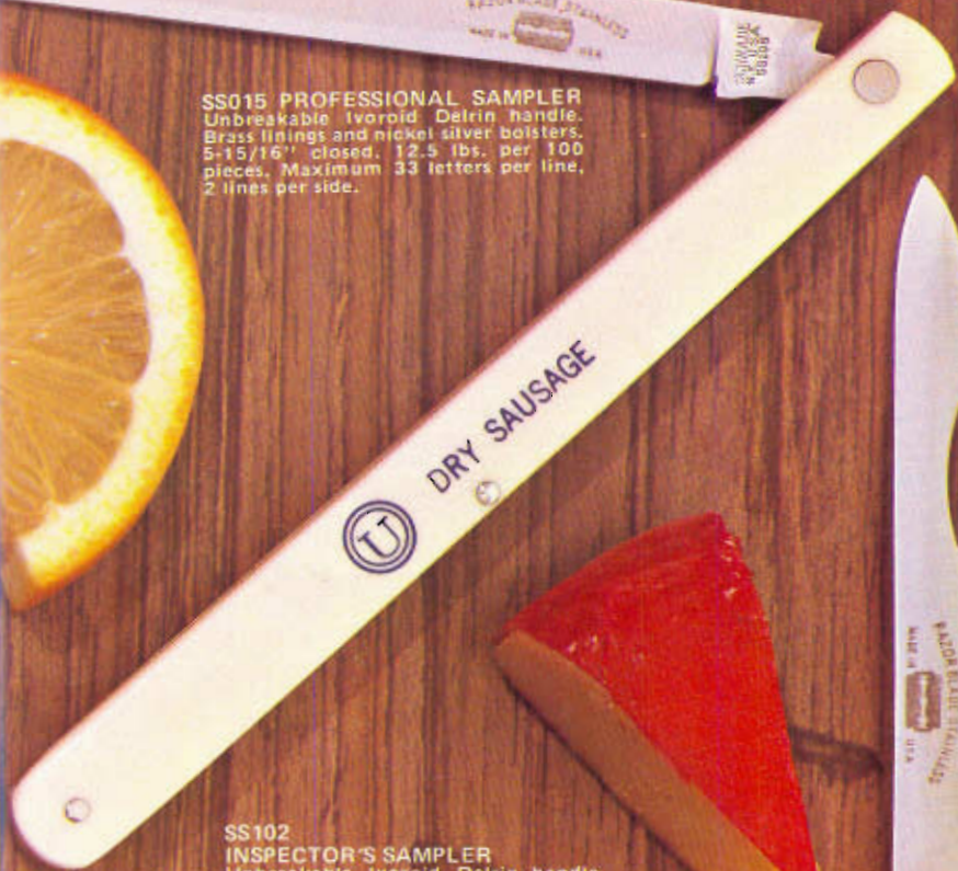
SS102 INSPECTOR'S SAMPLER Unbreakable Ivoroid Delrin handle. Brass linings. 4-11/16" closed. 11.5 lbs. per 100 pcs. Maximum 40 letters per line, 2 lines per side.