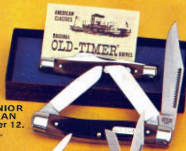
80T SENIOR STOCKMAN 3 1/2 lbs. per 12. 4" closed.