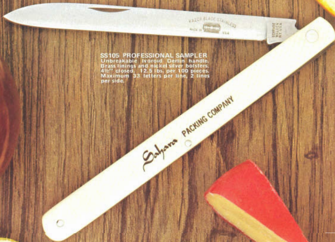
SS105 PROFESSIONAL SAMPLER Unbreakable Ivoroid Derlin handle. Brass linings and nickel silver bolsters. 4 1/2" closed. 12.5 lbs. per 100 pieces. Maximum 33 letters per line, 2 lines per side.