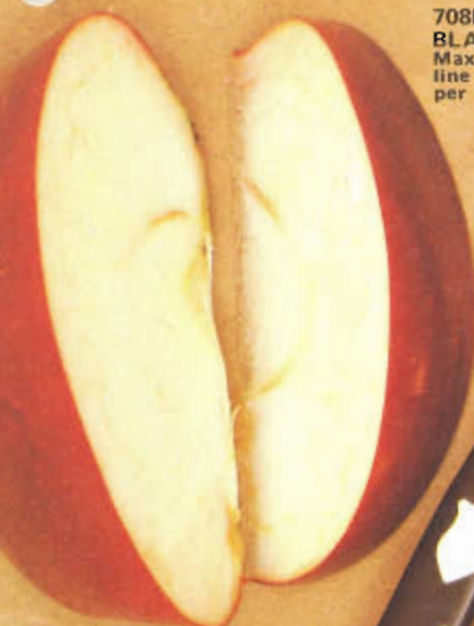
708B BLACK JACQUE Max. 18 letters per line — 1 line. \frac{3}{4} lb. per 12.

Custom-made, hand-crafted professional quality cutting implements cutlered for a lifetime of faithful service. Over 70 years of experience, combined with incomparable craftsmanship, assures sweet-cutting dependability — the epitome of the cutler's art.