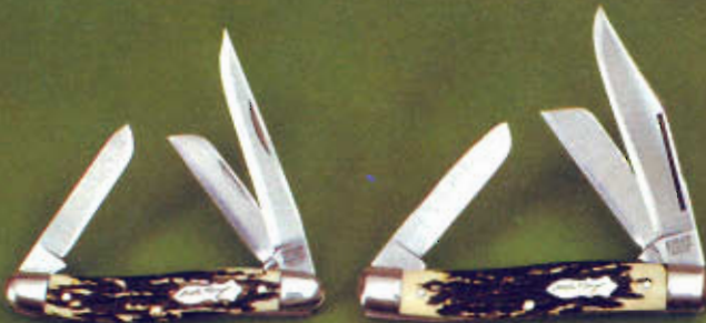
897UH PREMIUM STOCKMAN 3 1/4 lbs. per 12. 3-9/16" closed.