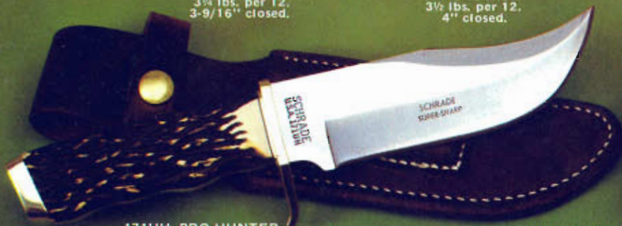
171UH PRO HUNTER w/sheath & sharpening stone. 18 lbs. per 12. 10 1/2" o/a. 5-5/8" blade.