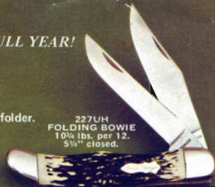
227UH FOLDING BOWIE 10 1/4 lbs. per 12. 5 1/4" closed.