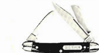
1080T — JUNIOR 2 3/4" long closed