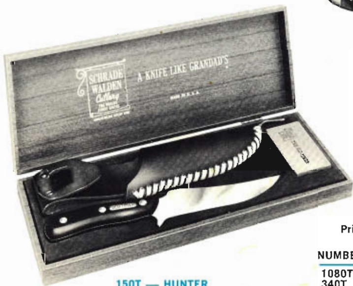
150T — HUNTER with sharpening stone and sheath. 10 1/2" long overall