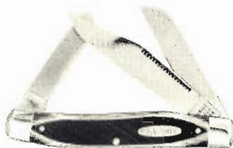
80T — SENIOR 4" long closed