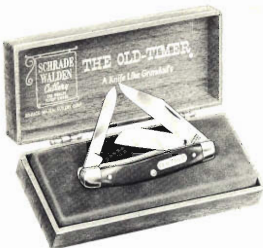
340T — MIDDLEMAN 3-5/16" long closed