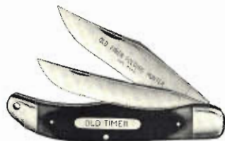
250T — FOLDING HUNTER with sharpening stone and leather sheath. 5 1/4" long closed