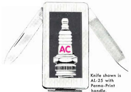
Knife shown is AL-25 with Perma-Print handle.

Any of the knives illustrated and described in this circular (except AL-1, AL-24, AL-41, AL-42) can be supplied with "Perma-Print" handles—priced in accordance with the schedule below. These prices include the cost of printing plates, but art work must be furnished by the customer. Due to the handling and specialized skill required for this new process no orders for less than 500 knives with "Perma-Print" handles can be accepted.